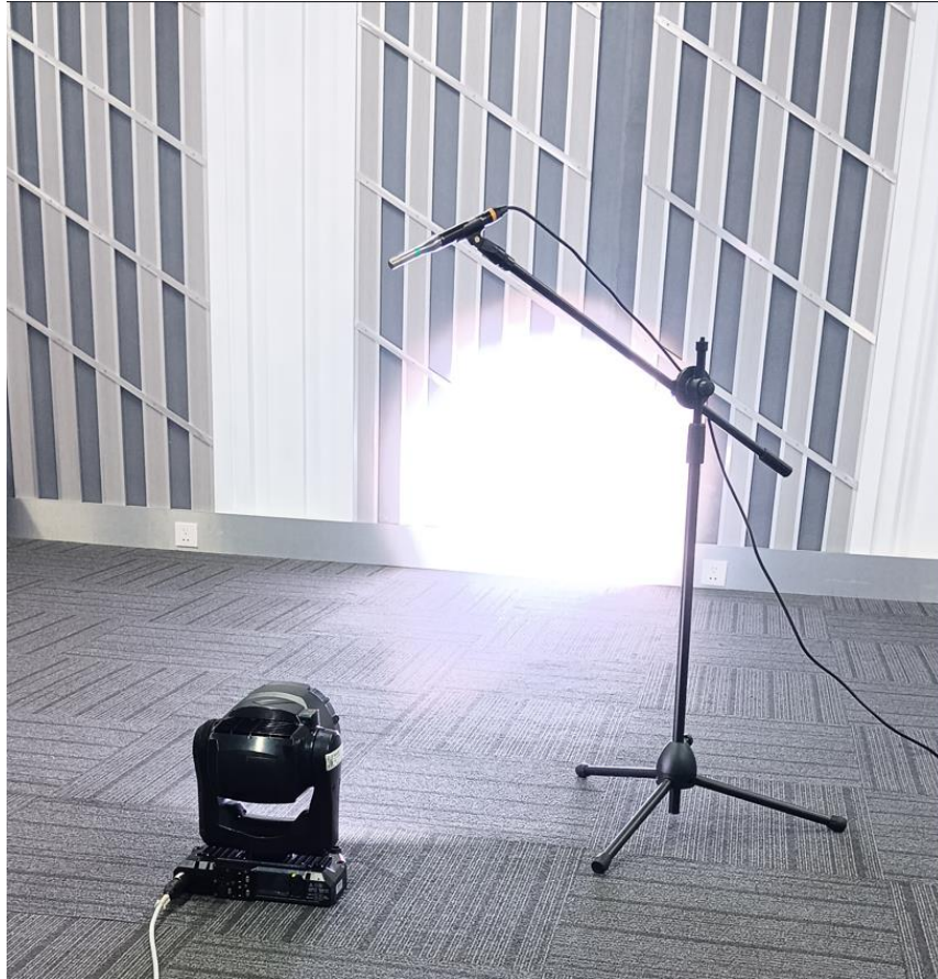
Figure 1: Test setup

The product was placed indoors in a semi-anechoic room in the internal Lab of Harman Technology in Shenzhen, China (See Figure 1). The main dimensions of the room were 5.9m * 4.9m * 3.3m (length * width * height).