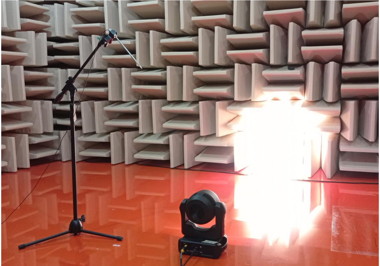
Figure 1: Test setup

The product was placed indoors in a semi-anechoic room in the internal Lab of Harman Technology in Shenzhen, China (See Figure 1). The ceiling and walls were all acoustically absorbent, and the floor was reflective. The main dimensions of the room were 5.9m * 4.9m * 3.3m (length * width * height).